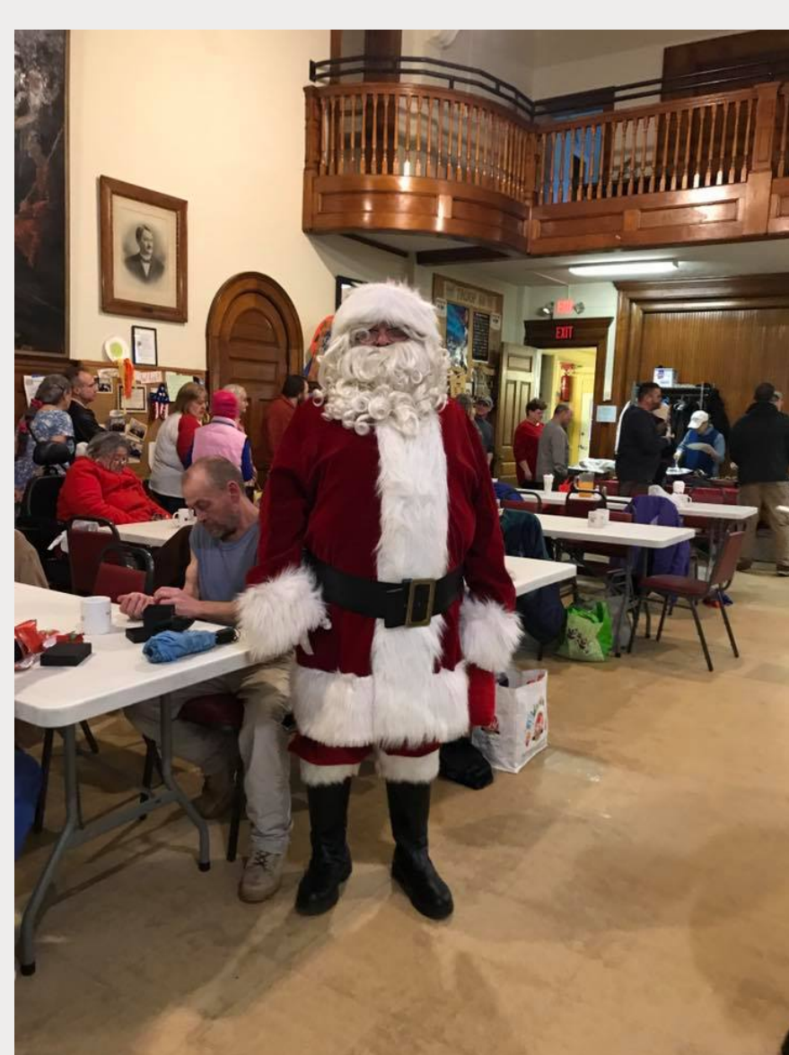
A photo from last year's Christmas dinner, featuring Santa's visit.

And best wishes on any other December holiday you may be celebrating!